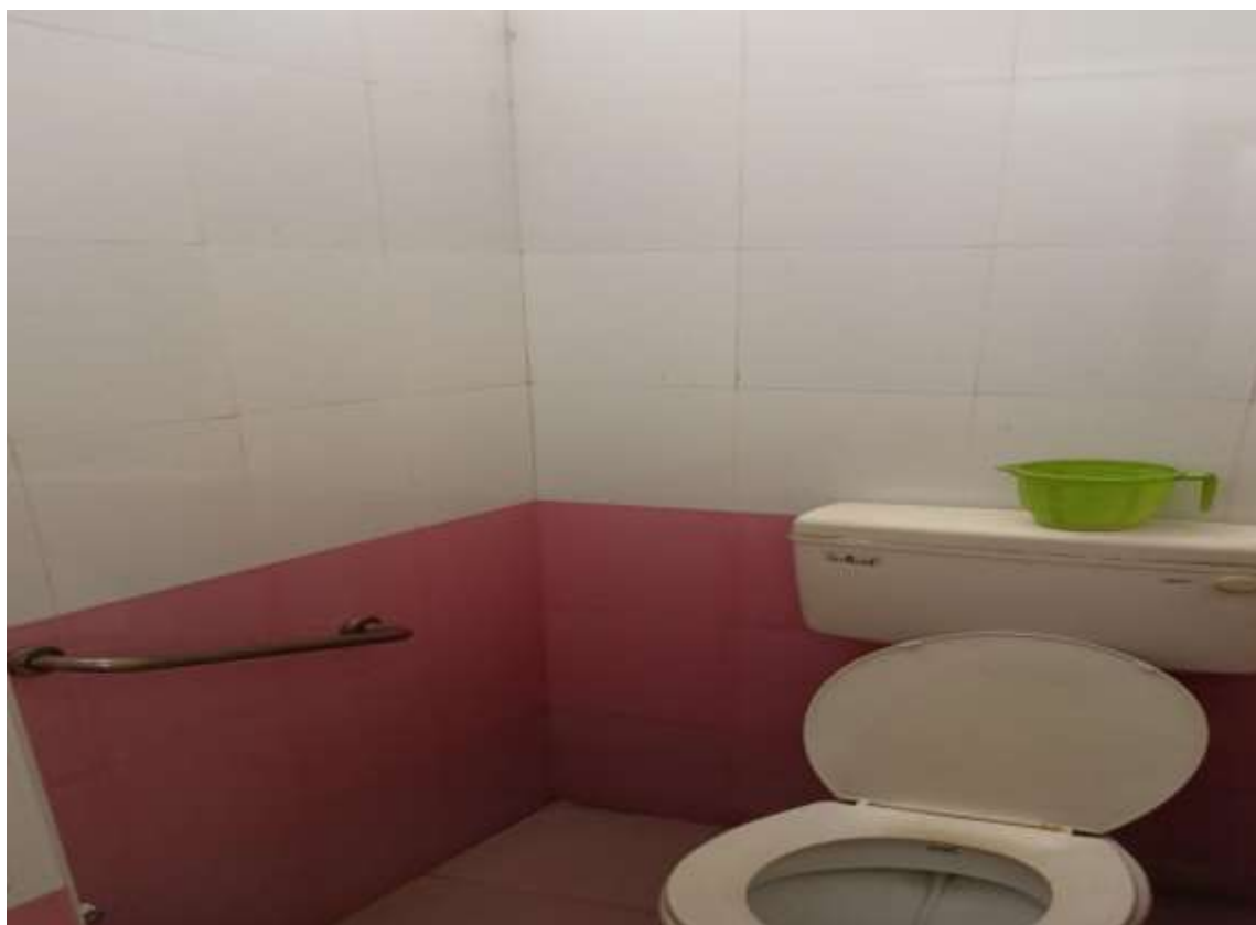
Disabled friendly Toilet