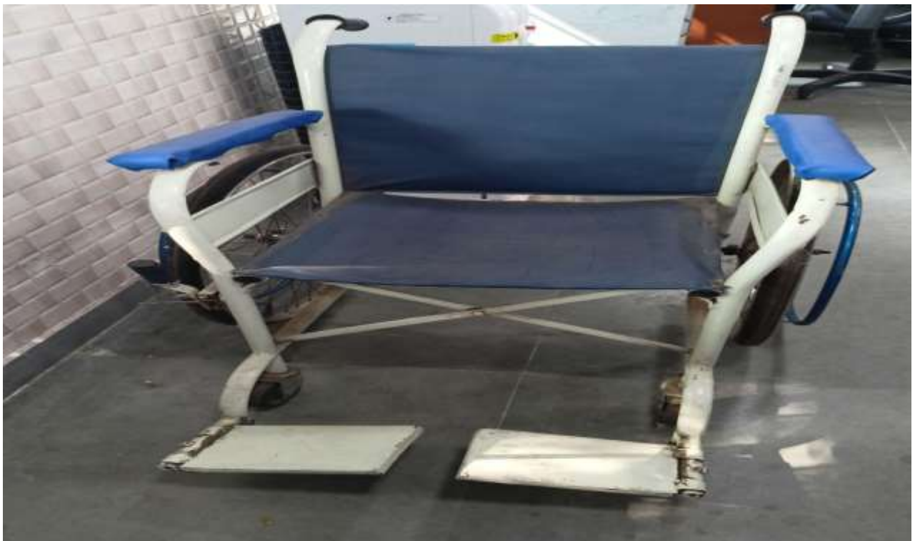
Wheelchair for the Differently Abled Students