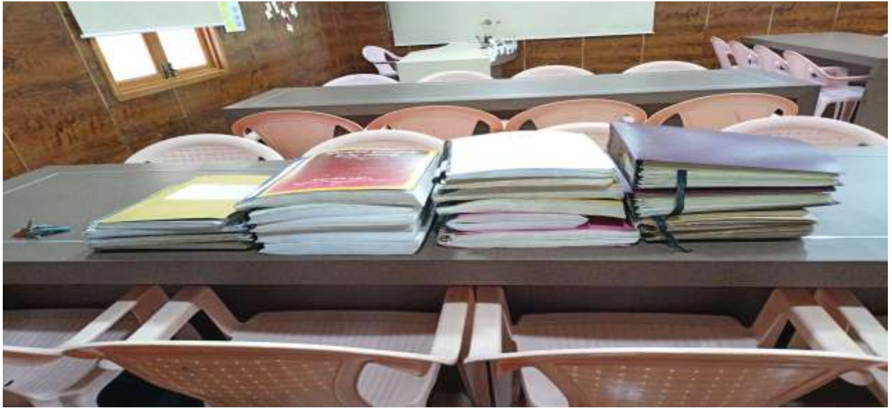
Braille Books in Library